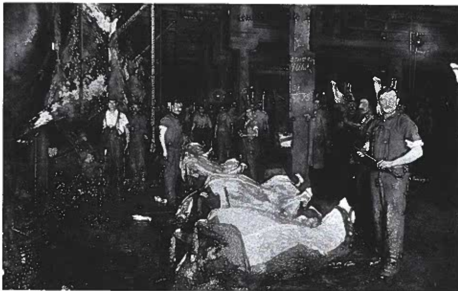
Floorers removing the hides, Union Stock Yards, Chicago. Date unknown.